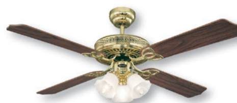
Oak cane/ Mahogany

Electricity consumption/year: ..... 17,72 kWh RPM: ..... 175/120/75 Wattage: ..... 58/40/26 Noise level: ..... 49,80dB(A) Motor size: ..... AC Motor 153 x 15 mm Lamp socket: ..... 3 x E 14, each max. 60 W (not included) Maximum fan flow rate: ..... 163,06 m³/min Blade pitch: ..... 11° Max. ceiling pitch: ..... 13°