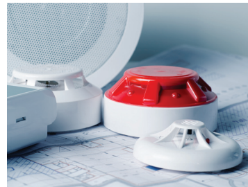
Fire alarm systems