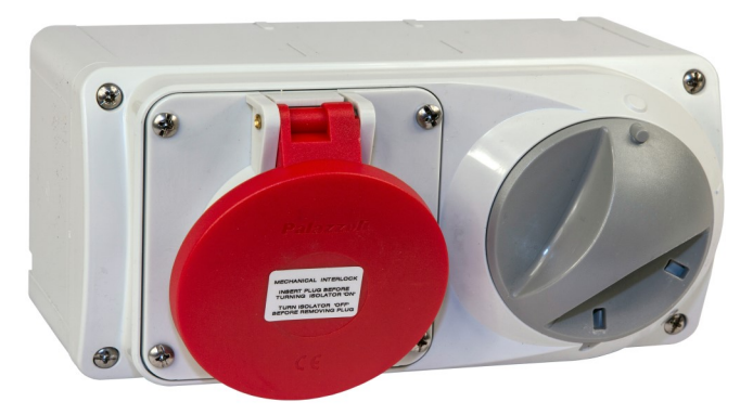
Socket-outlets with switch