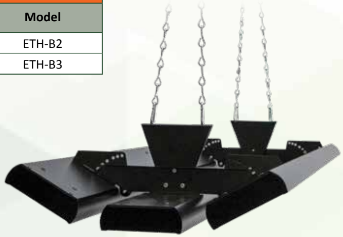
Brackets for suspending or wall-mounting 2 and 3 heaters