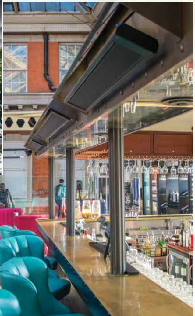
'All Black' heaters mounted above a bar in London's Waterloo Station