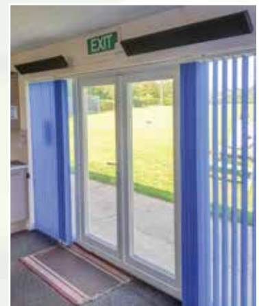
ETH heaters installed indoors in a Norfolk sports club