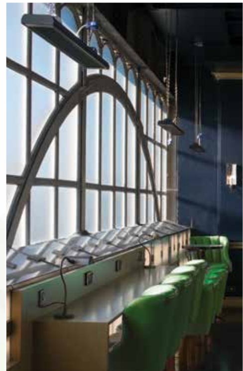
'All Black' heaters are ideal for suspension above dining areas