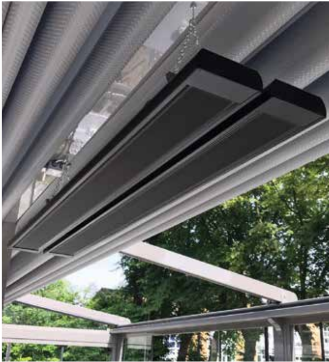
Two heaters suspended using a ETH-B2 bracket in a sheltered dining area